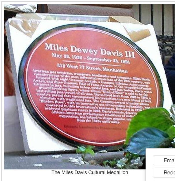
The Miles Davis Cultural Medallion

Share this: Google +1 Facebook 14 Twitter 5 Pinterest Print More